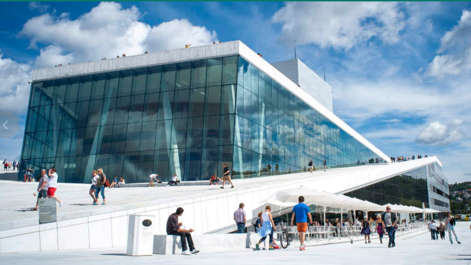
EXHIBIT AND SPONSORSHIP OPPORTUNITIES